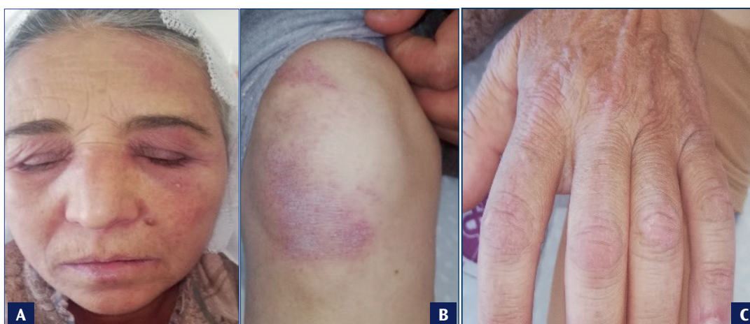
Figure 1. A. Bilateral lilac discoloration of the eyelids, B. Violaceous skin changes over the knees (Gottron sign), C. Gottron papules on the finger joints

In magnetic resonance imaging, signal increase in T2 images and local contrast enhancement in post-contrast series were observed in bilateral thigh muscles (Figure 2A and 2B). In view of current clinical and laboratory findings, the patient was diagnosed with dermatomyositis and was started on methyl prednisolone 120 mg/day (intravenous), hydroxychloroquine 2x200 mg, methotrexate 15 mg/week (peroral), folic acid 5